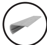
Overlap Stair Nose