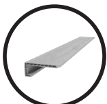
Flush Stair Nose