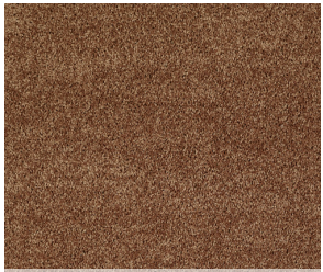
721 Desert Sunrise