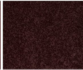
902 Royal Purple