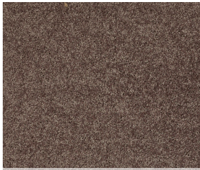
740 Barn Beam