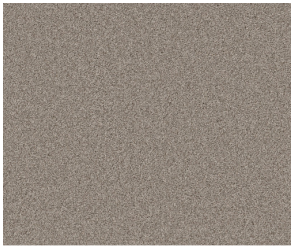
701 Desert View