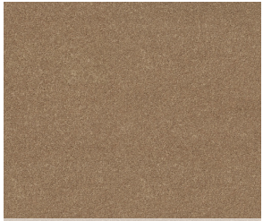
793 Field Khaki