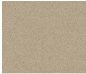
771 Cookie Dough