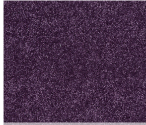
931 Grape Slushy