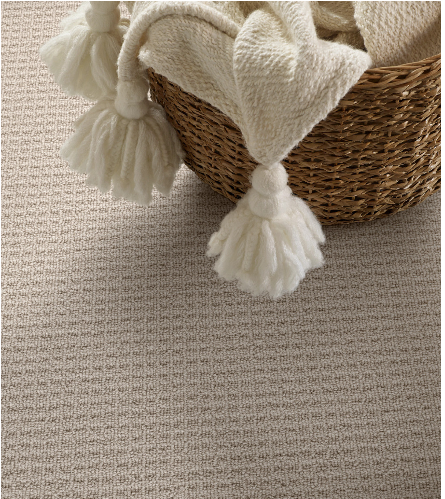
107 Natural Wood