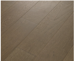
5052 Ashlee Grey