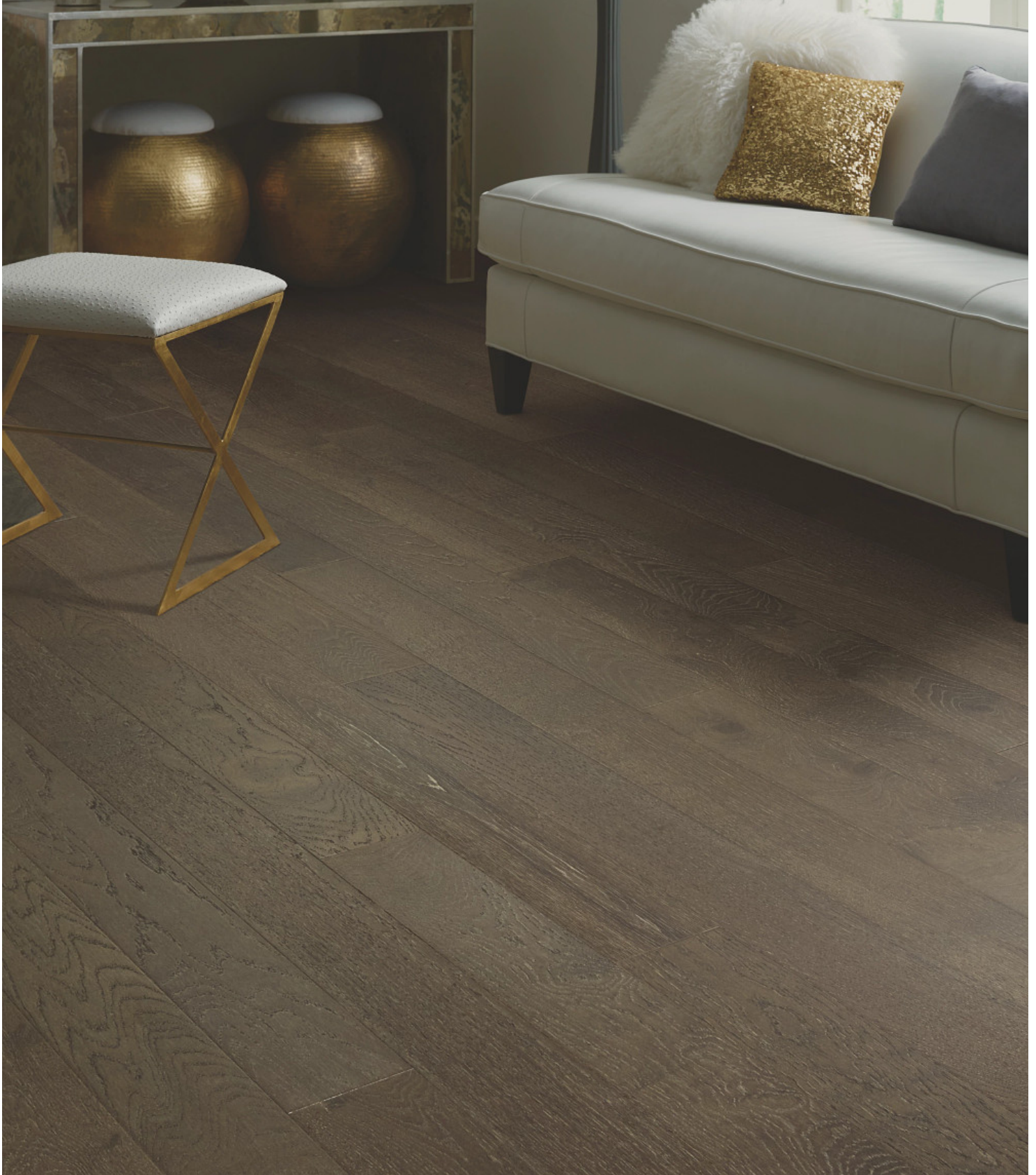
5052 Ashlee Grey