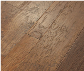
2000 Pacific Crest