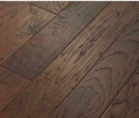
941 Three Rivers