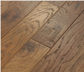
2000 Pacific Crest