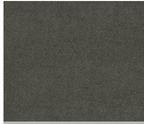
704 Smooth Slate