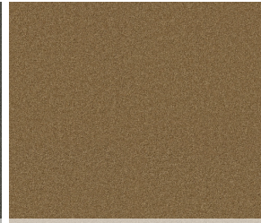
722 Honey Pot