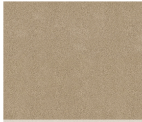
126 Beach Walk