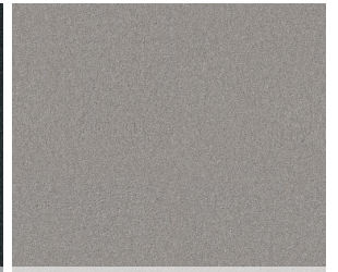
500 Sheer Silver