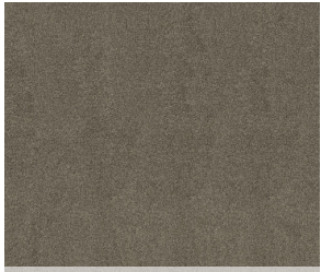
501 Grey Flannel