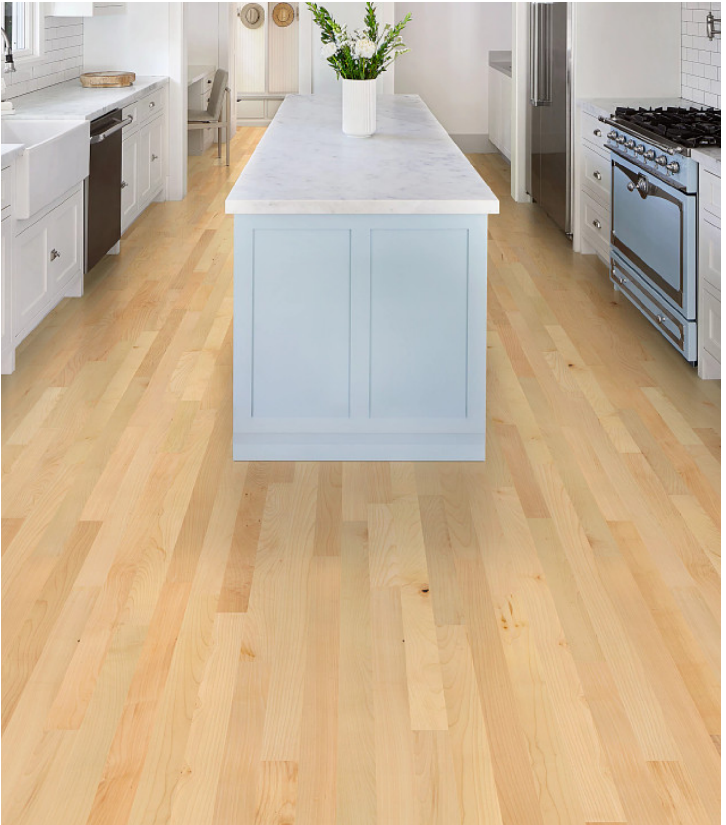
1148 Natural Hard Maple

NATURAL CLASSICS HARD MAPLE 3" Engineered