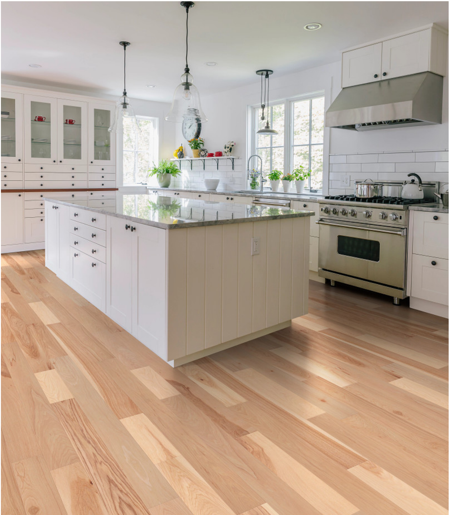
1157 Natural Hickory