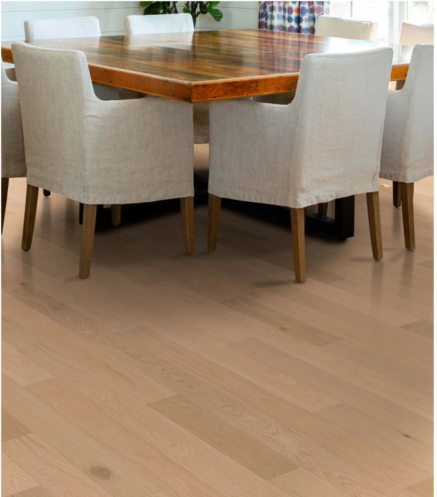
1147 Natural White Oak