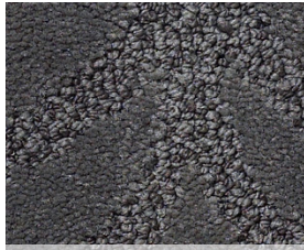
00752 Glacier Park