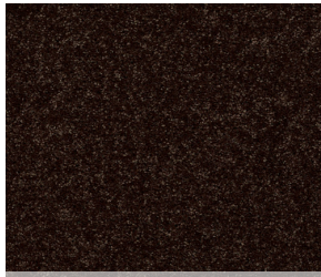
705 Coffee Bean