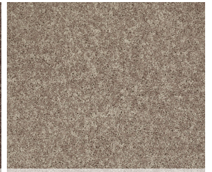
720 River Slate