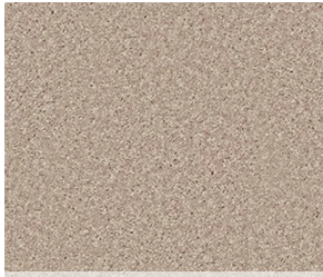
740 Barn Beam