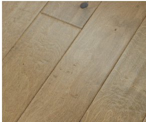
1023 Crescent Beach