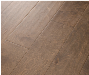
17051 Low Tide