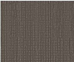
706 Tree Bark