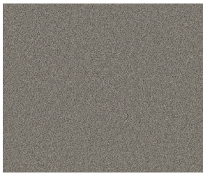
570 Cold Springs