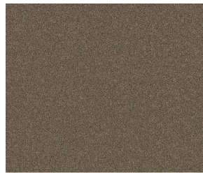
770 Baltic Brown