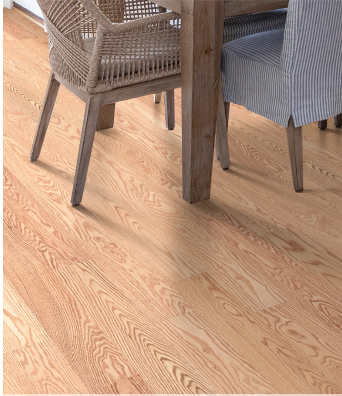
1149 Natural Red Oak