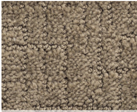
00755 Porous Stone

Product image for illustration purposes only; Actual product will vary.