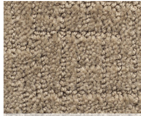
00723 Stucco Tan