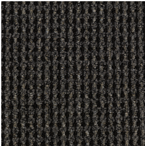
Gravel Roads (ATII-8)