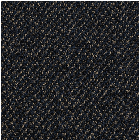
Great Barrier Reef (ENII-5)