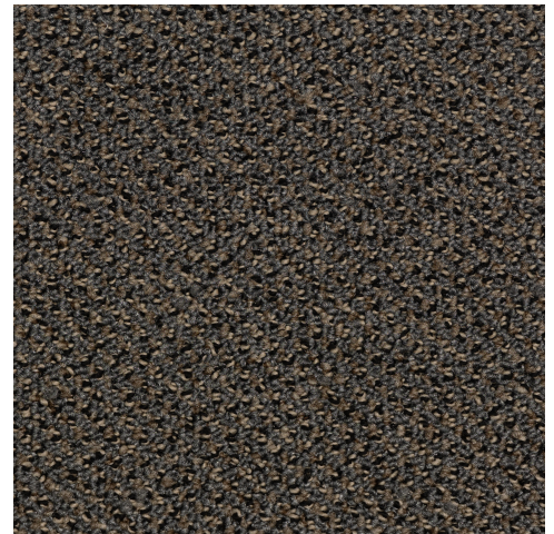
Taj Mahal (ENII-7)